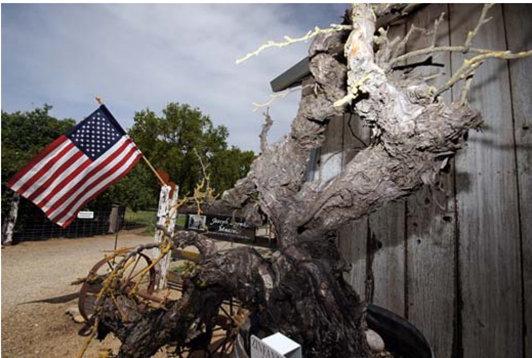
This gnarly, tree-like thing is a 118-year old Zinfandel vine at Jessie's Grove Winery in Lodi.

Scott Harvey Vineyard 1869 Zinfandel - 96% of the grapes for this wine come from the Zinfandel vineyard officially recognized as America's oldest, planted in Amador County in 1869 or earlier. Of course, not all of the vines are that old. But, still.