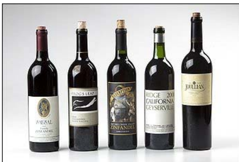
Recommended zins

When I fell in love with wine, I fell in love with zinfandel. My wife and I developed our palates during vacations in California, with each successive visit devoted less to national parks or city landmarks and more to wine country. We'd try anything, but when we came back home it was zinfandel that captivated us with its wild, swashbuckling flavors and its devil-may-care sense of adventure. It transported us back to the West, a faraway land where we'd say we were from Washington and it would take a few minutes before someone would ask, "Oh, you mean D.C.?"